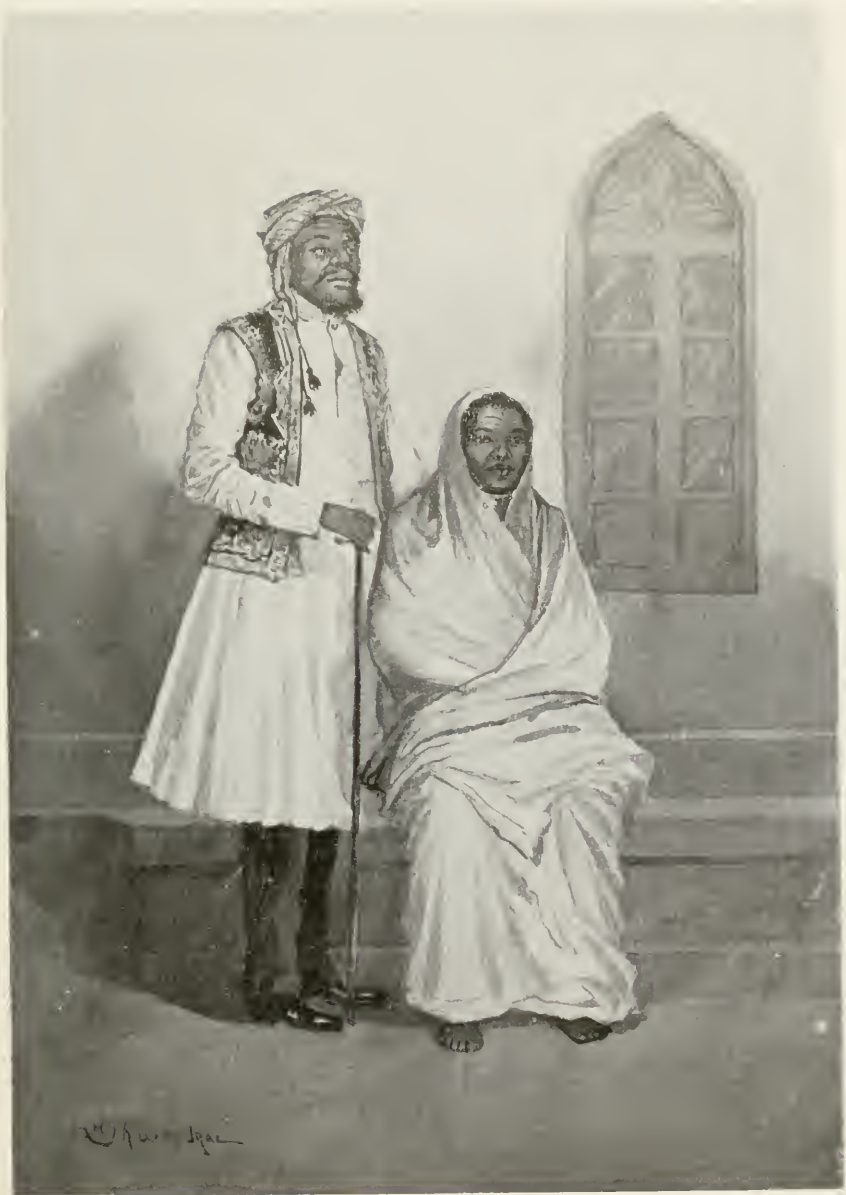
SIDIS OF BOMBAY.