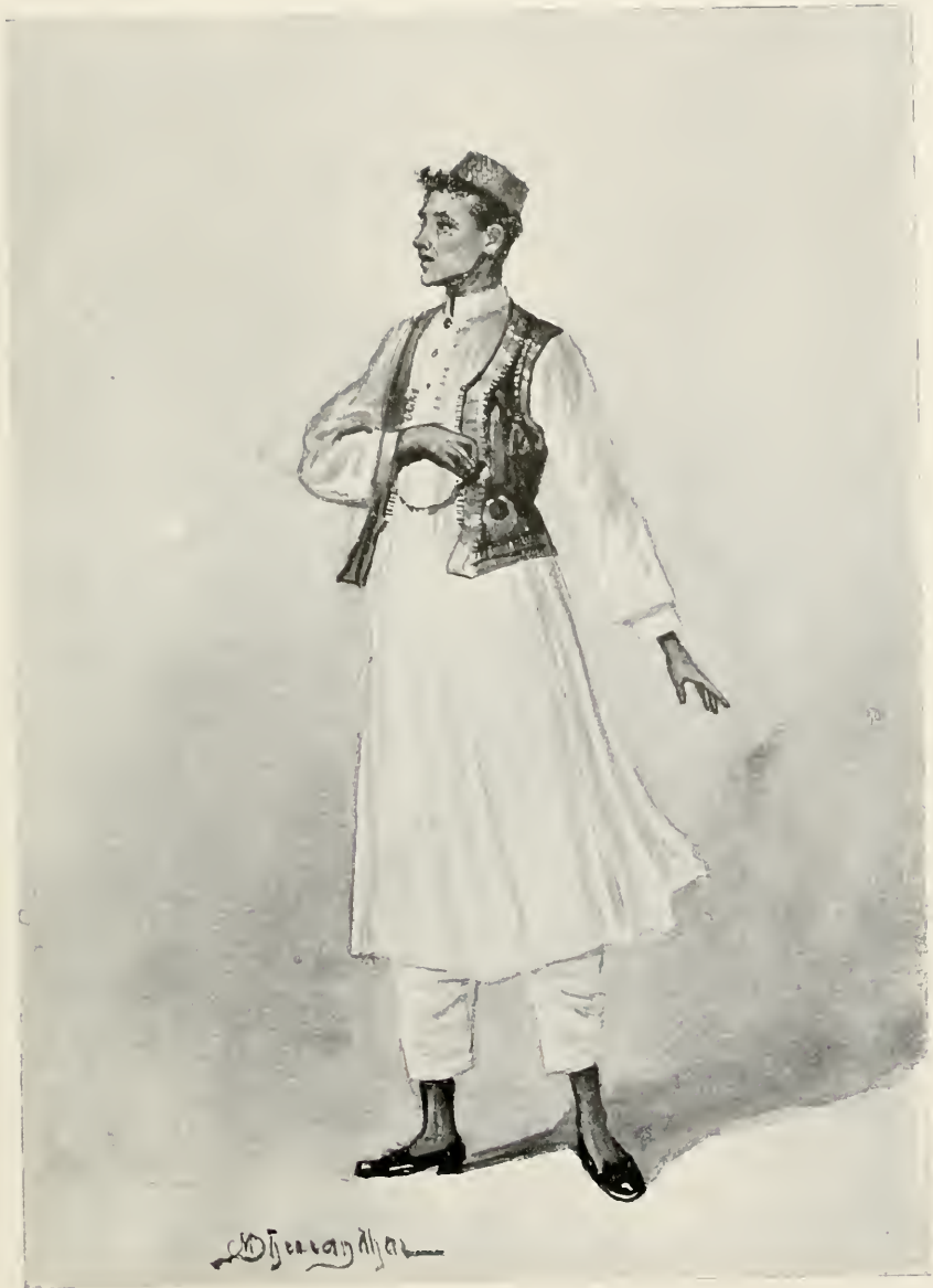
A Bombay Memon.