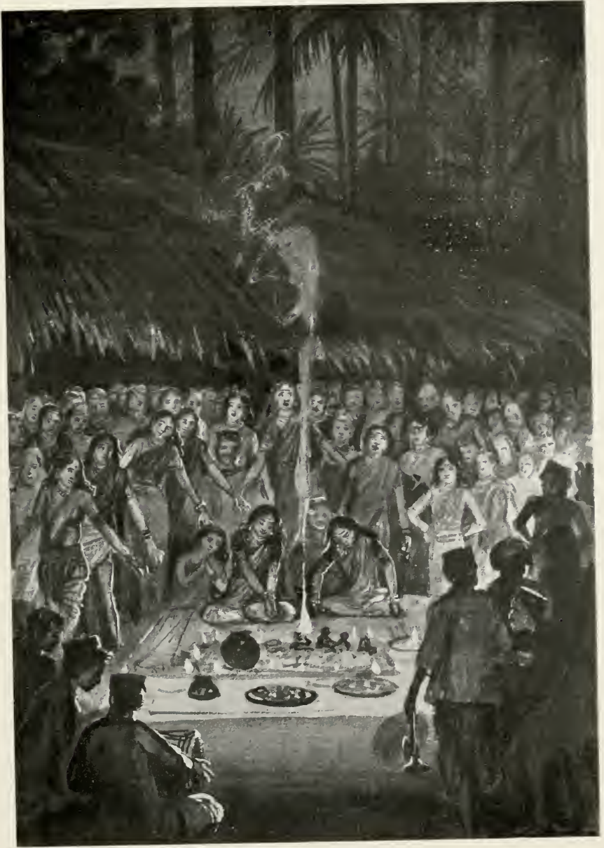
A Bhandari Mystery.