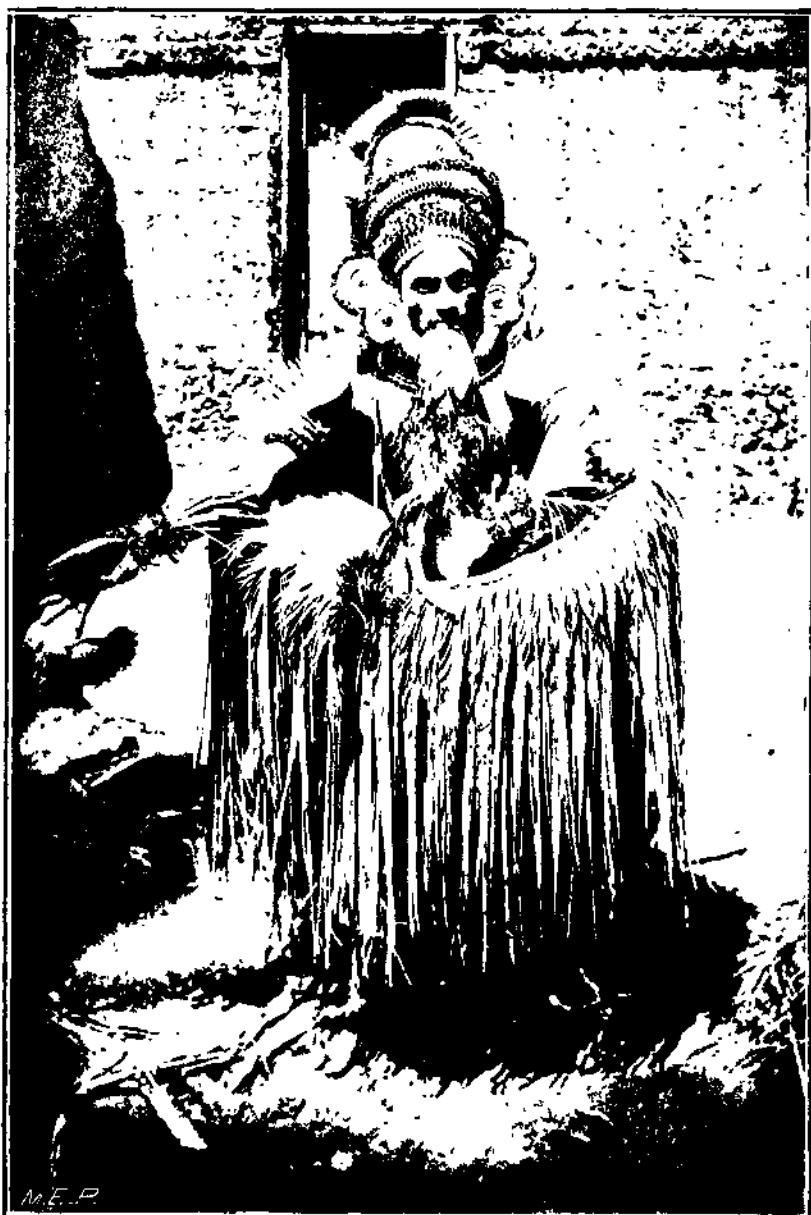
MALAYAN DEVIL-DANCER WITH FOWL IN MOUTH