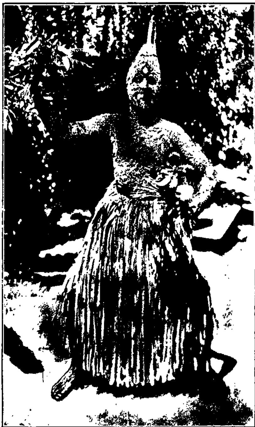
MALAYAN DEVIL DANCER