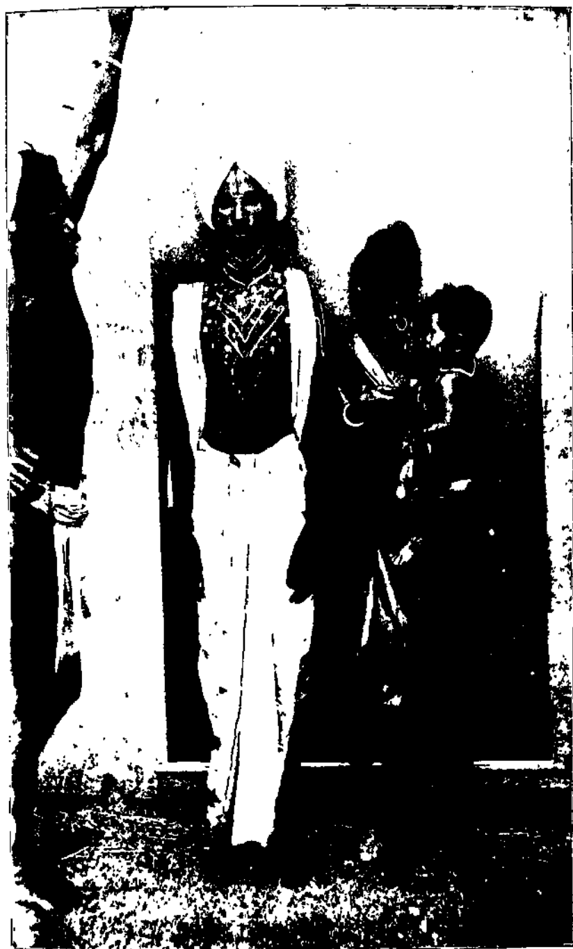
MADIGA BRIDAL PAIR.