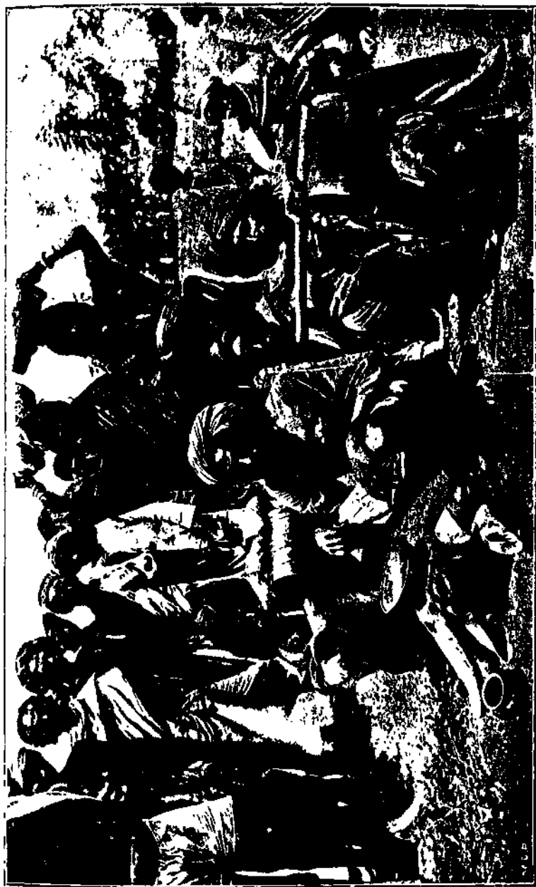
UFFALO SACRIFICE. HEAD WITH FOOT IN THE MOUTH.