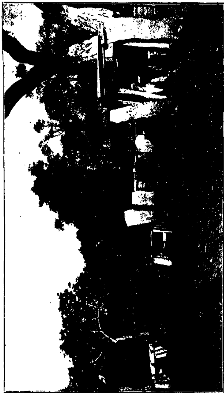
KURCUBA DOLMEN-LIKE GRAVES.