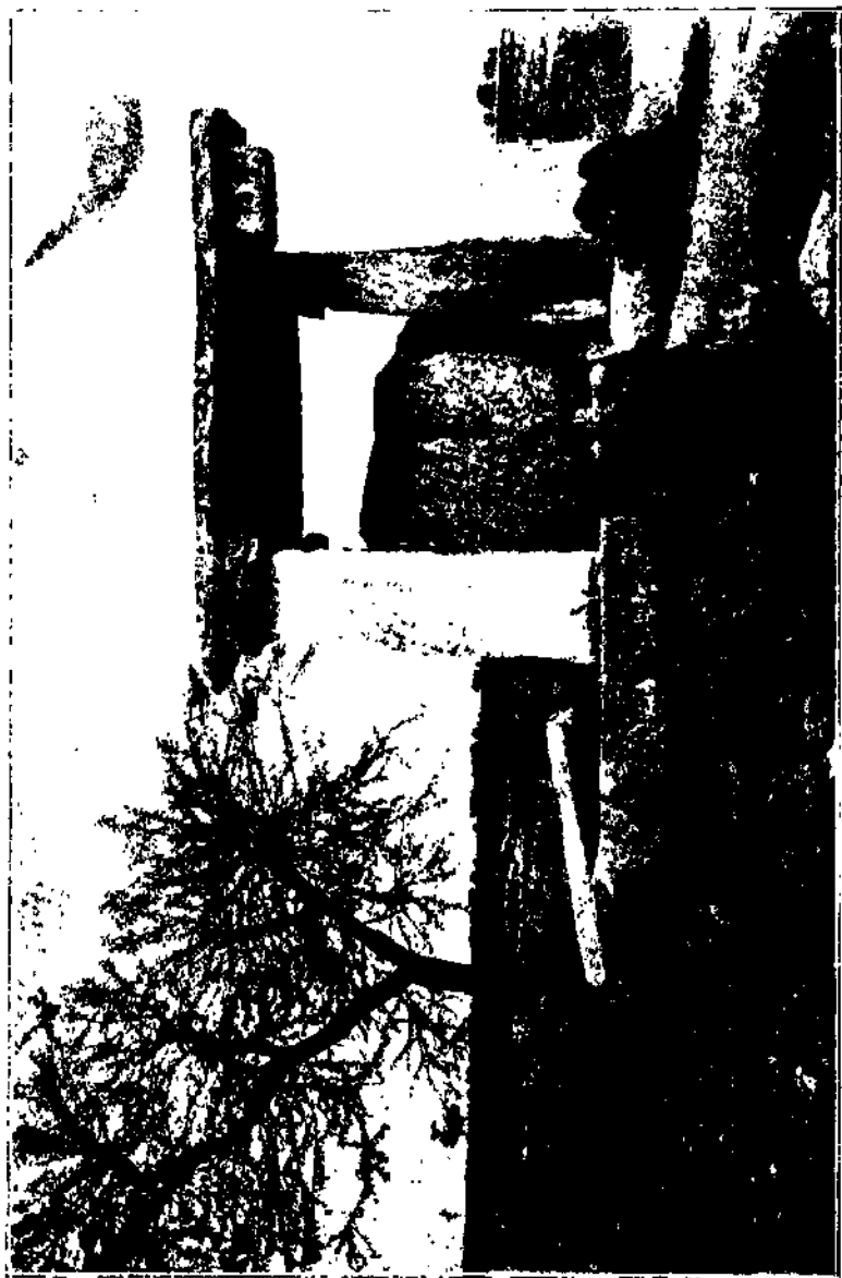
KURUBA BIKADÉVARE TEMPLE