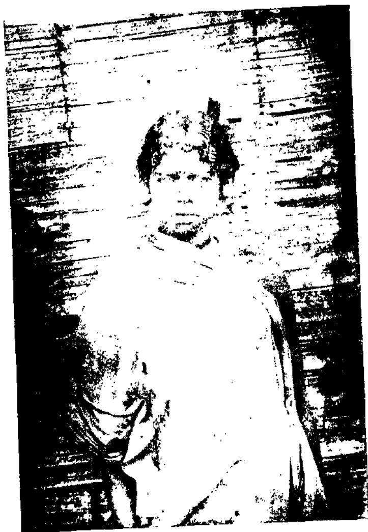
KÄDIR GIRL WEARING COMI