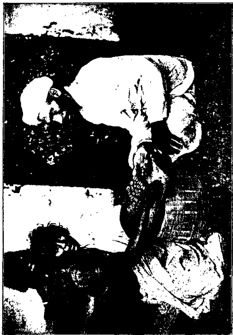
THE WOMAN TELLING FORTUNE