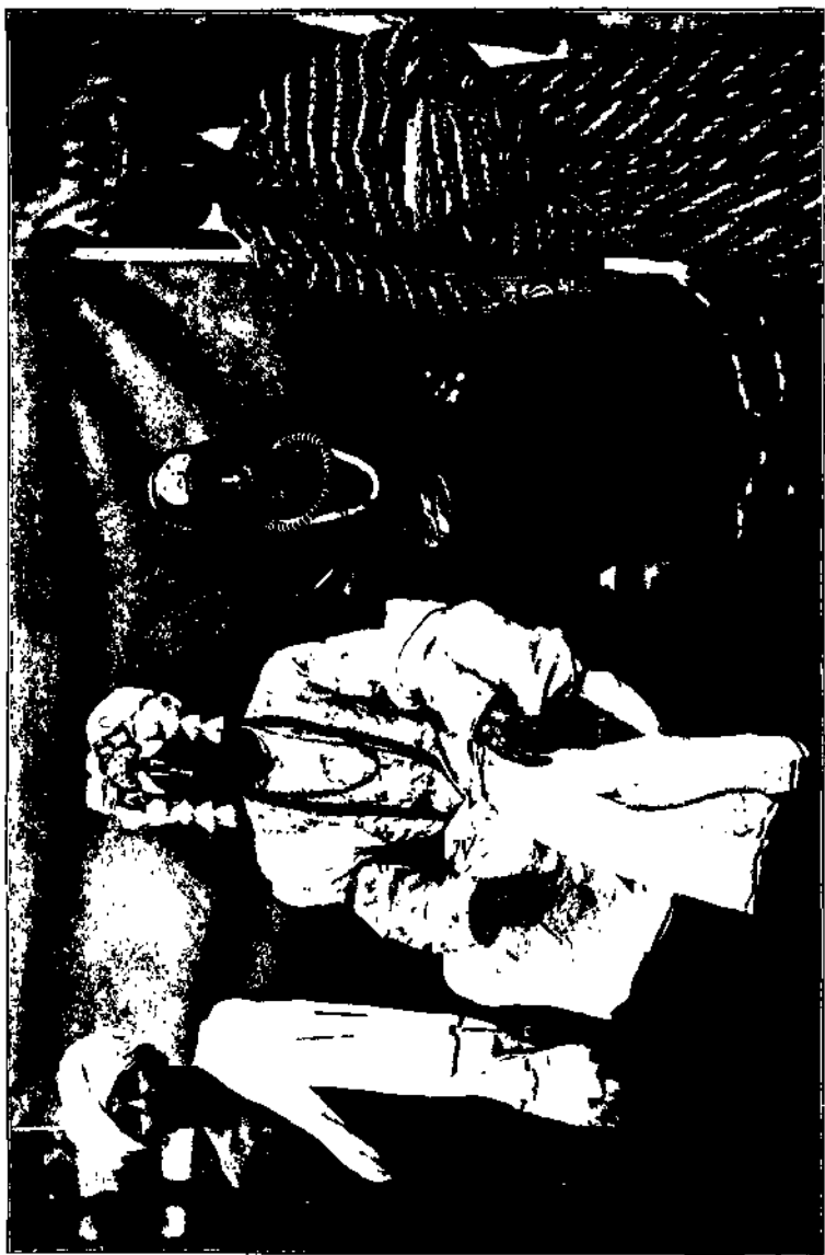
KÄPE BRIDE AND BRIDEGROOM.