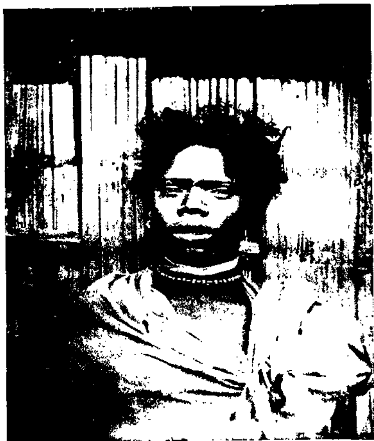
KĀDIR BOY WITH CHIPPED TEETH