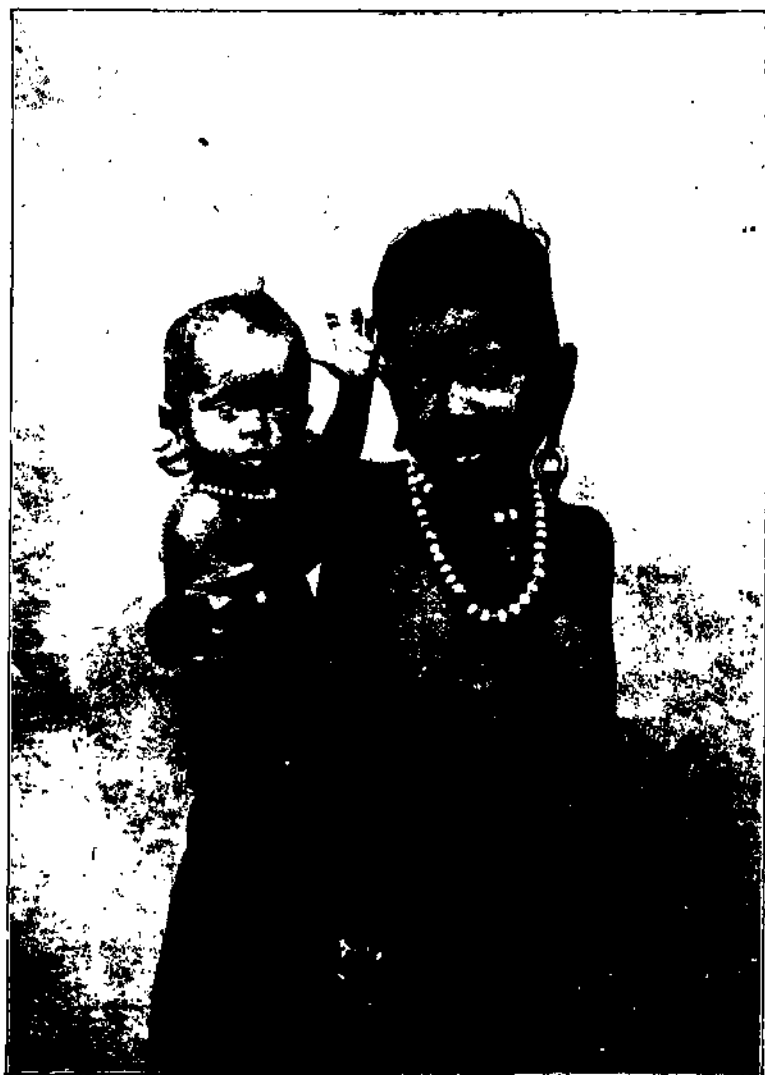
KALLAN CHILDREN WITH DILATED EAR-LOBES.