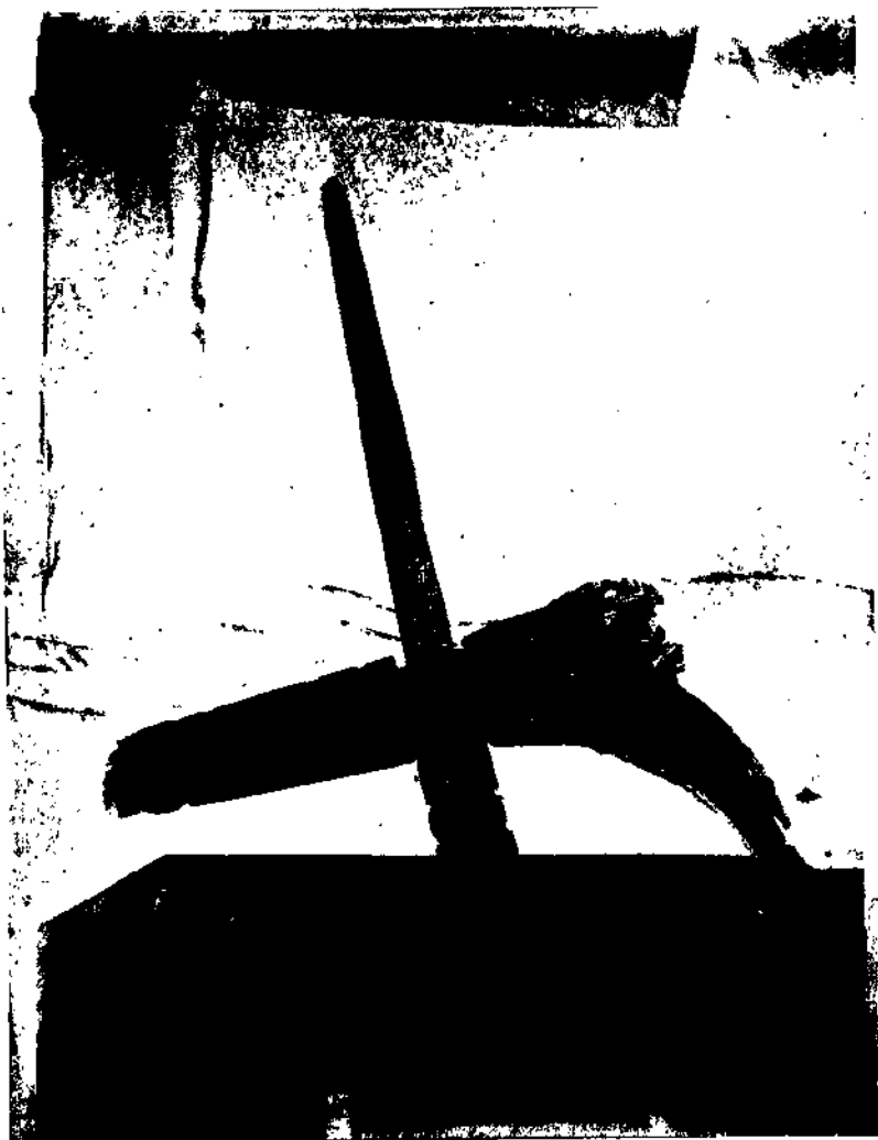
MERIAM SACRIFICE POST.