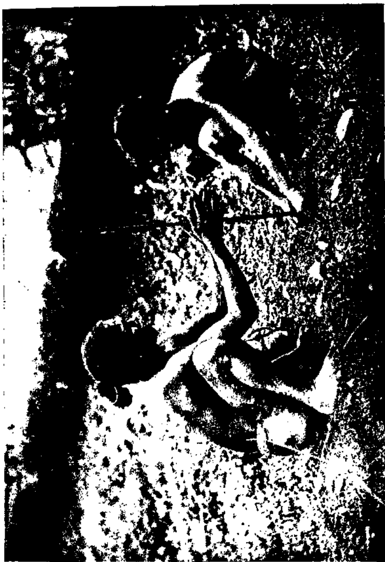
KĀNIKARS MAKING FIRE.