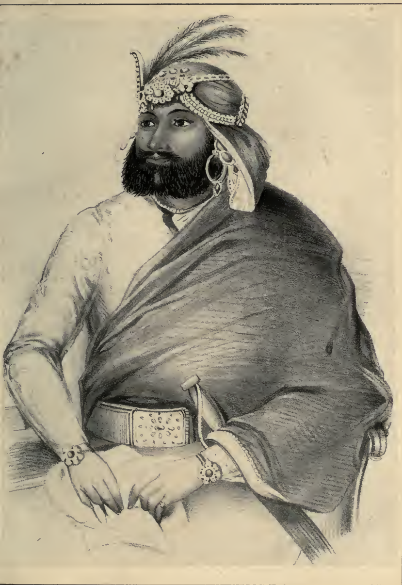
THE LATE MAHARAJAH SHER SINGH