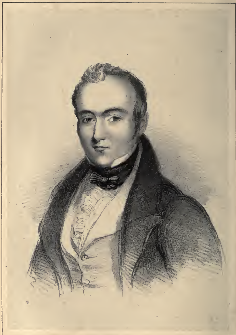
THE LATE SIR WILLIAM HAY MACNAGHTEN BART.