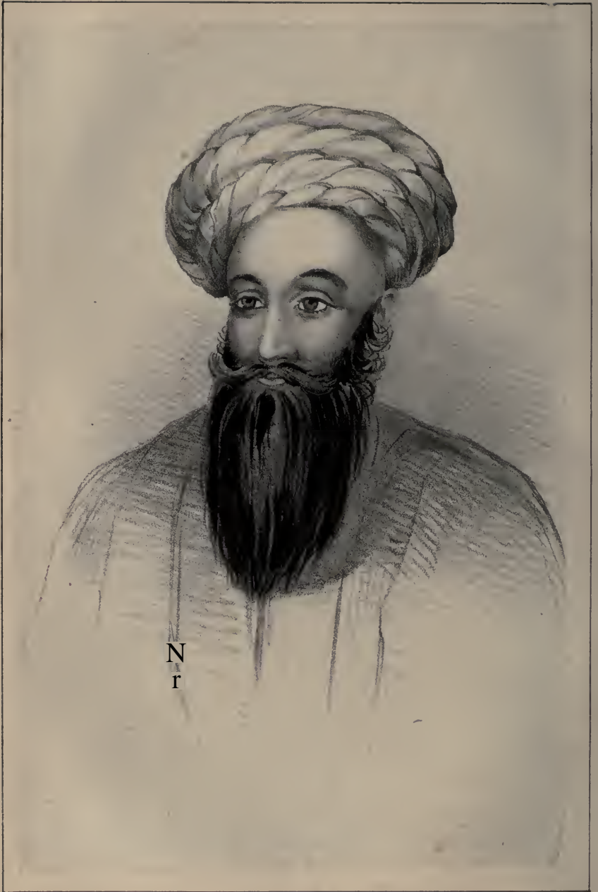
HIS LATE MAJESTY SHAH SHUJAH UL MULK.