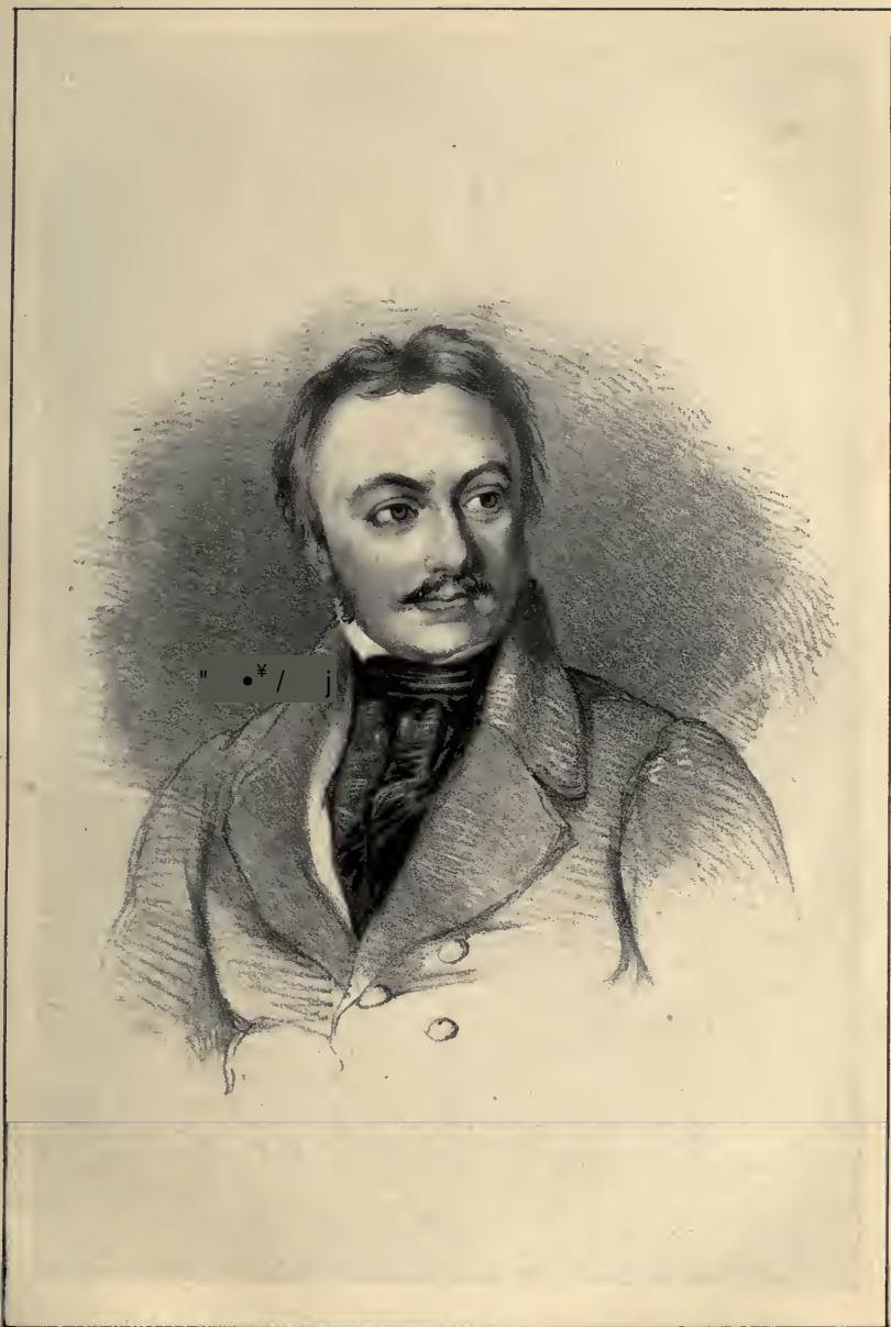
SIR HENRY POTTINGER G.C.B.