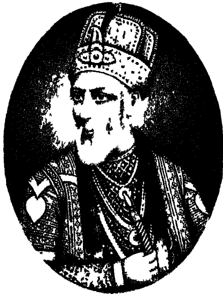
MAHAMMAD BAHADUR SHAH, EX KING OF DELHI

( FROM A MINIATURE IN THE CENTRAL MUSEUM LAHORE )