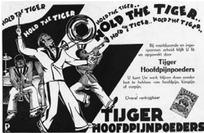
Illustration 5 Modern jazz music was also regularly associated with noise, as evidenced by this advertisement for a medicine to combat headaches. Published in periodical D'Orient , Netherlands East Indies, 1936