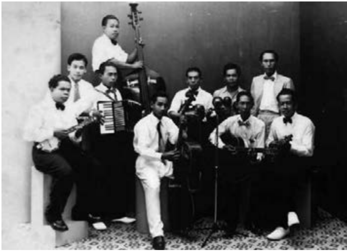
Illustration 3 Rajuan Irama, an Malay orchestra, c. 1935