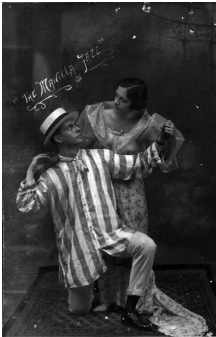
Illustration 4 Two Europeans dressed Filipino-style representing 'Manila Jazz', Indonesia, c. 1920s