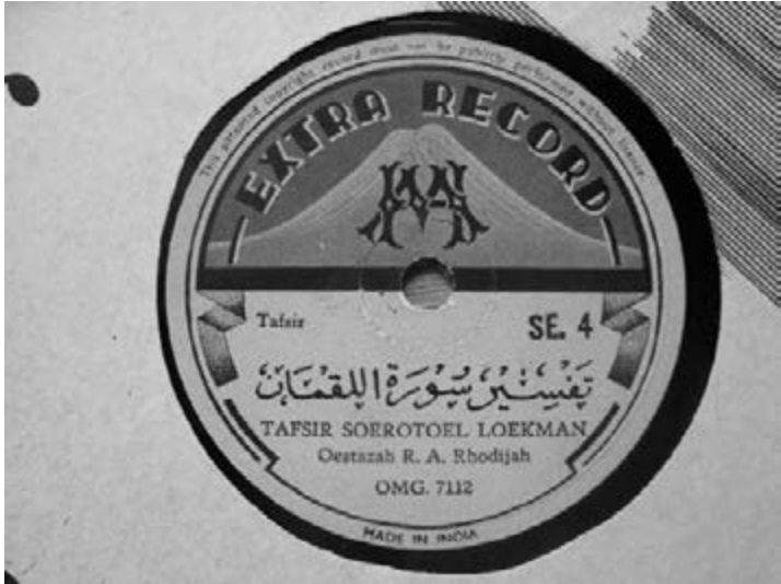
Illustration 2 Quranic text interpretation ( tafsir ) and translation from Arabic to Malay by a female religious expert ( ustazah ) recorded by Extra Records (His Master's Voice) in Indonesia, c. 1938