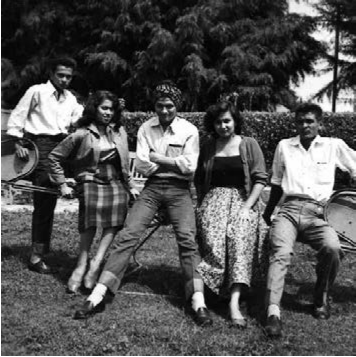
Illustration 10 Fashion-conscious Bandung youth sporting tight jeans, c. 1957