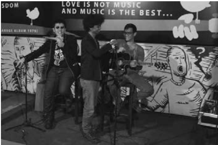
Illustration 14 #SoundCloud Meetup YK in the Momento Café, Yogyakarta, 26 February 2014

Inspired by the example of European and American peers, a group of young amateur musicians from Yogyakarta launched the idea for a local SoundCloud community, SoundCloudYK, in November 2013. It enabled a local community, already well connected through social media, to meet each other face-to-face, while listening to each other's music. Such offline meetings followed earlier initiatives where online collaboration led to joined ventures, such as ten covers of the same song or a one-hour live stream of local SoundCloud songs that were broadcast daily at campus radio. SoundCloud facilitates such initiatives through monthly SoundCloud Meetups, offline sessions that focus on anything from vocal training to ethnically inspired music. Three-monthly SoundCloud Shows are public events that bring together local acts and local music fans. Mostly staged at local cafes, these shows provide fledgling musicians with a venue. Next to the stage a projector beams incoming Twitter feeds, a clear illustration that these gatherings are rooted in the social media sphere. Anyone with a SoundCloud account can climb the stage!