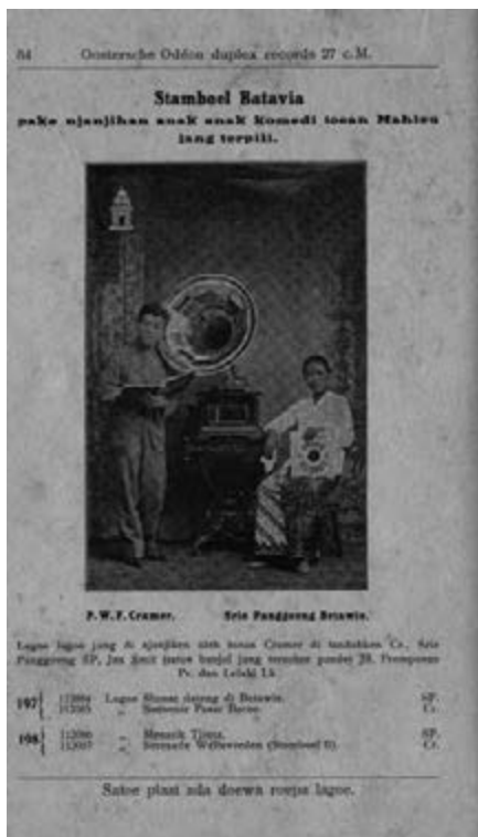
Odeon record catalogue, c. 1912