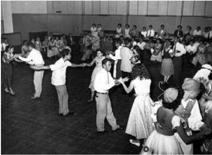
Illustration 9 New American dances were tried on the dance floor at social gatherings such as at this Bandung high school party, c. 1957.