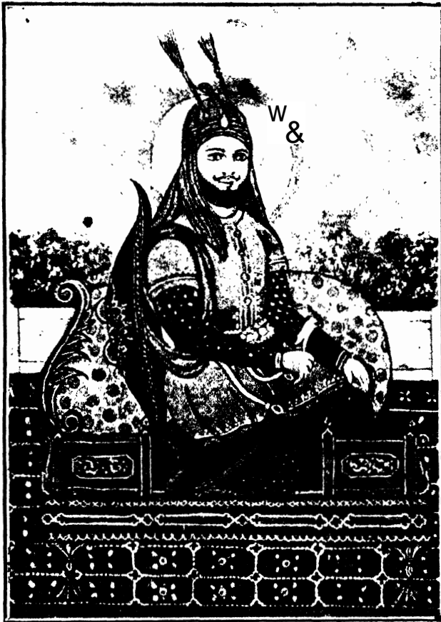
SHER SHAH AFGHAN.