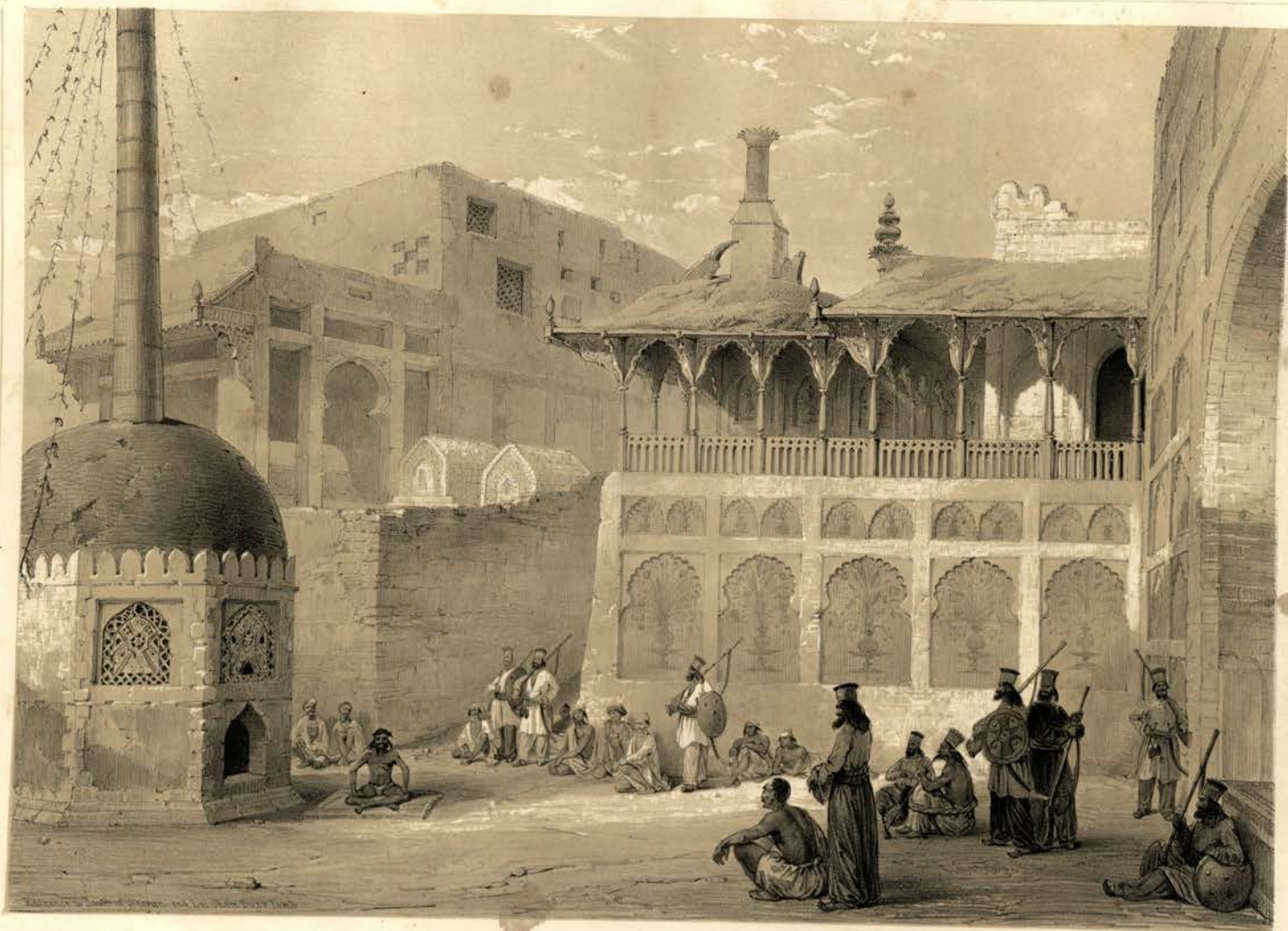
ENTRANCE TO TOWN OF SHEWAN, AND LAL SHAH BAZ'S TOMB.