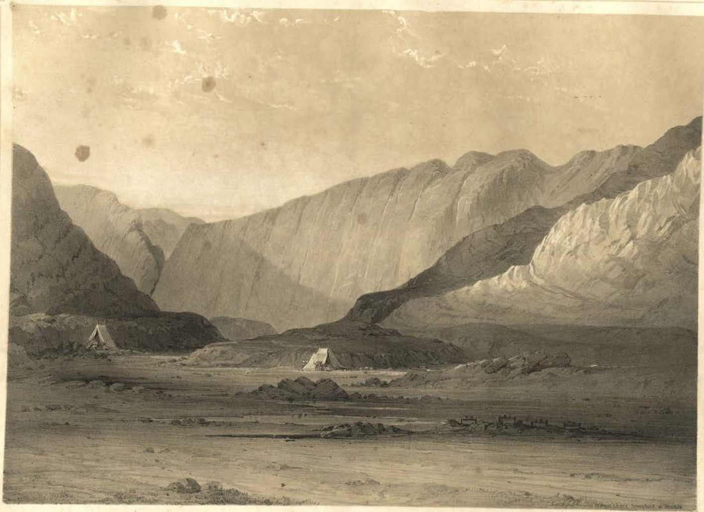
SOUTHERN ENTRANCE TO BEJAR KHAN'S STRONGHOLD, AT TRUCKEE.