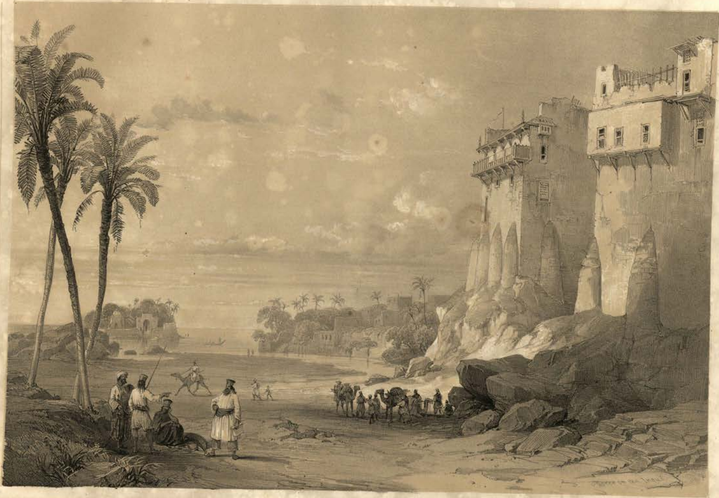
ROREE ON THE INDUS