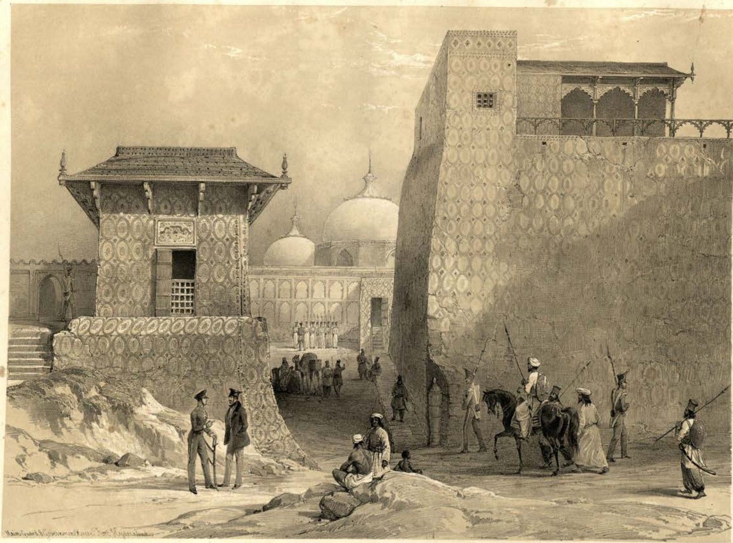
MAIN GUARD AND GOVERNMENT HOUSE FORT HYDERABAD.