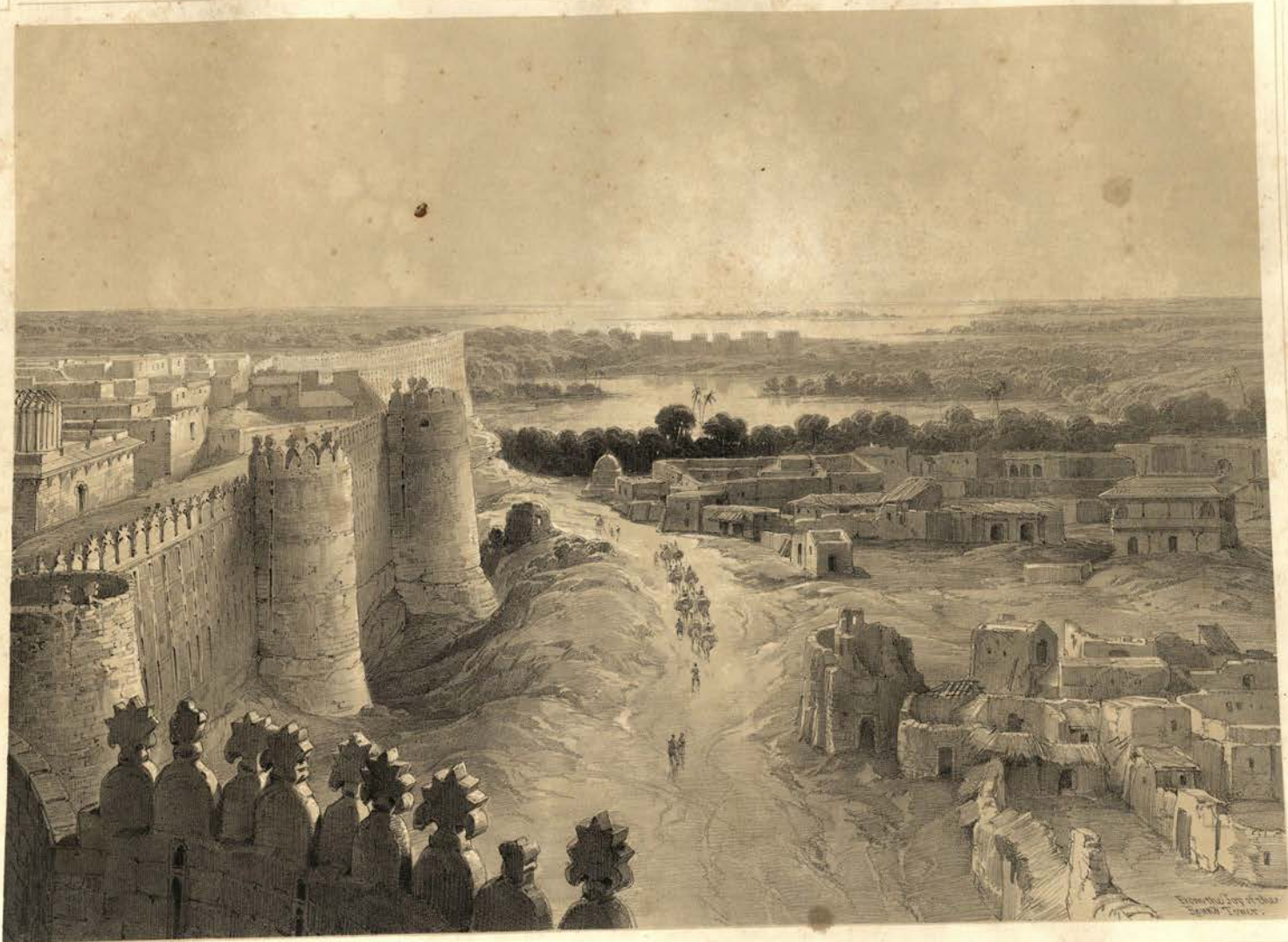
FROM THE TOP OF THE ROUND TOWER, FORT HYDERABAD