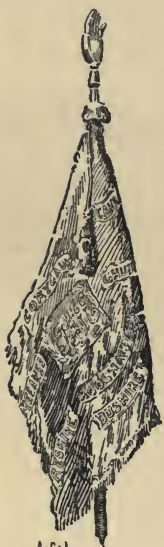
The Poona Horse Standard, surmounted by a silver hand, captured at the battle of Koo-shab.

must be the motive power that brings Hindu and Musalman, Afghan and Indian, Sikh and Gurkha, to an alien ruler and an alien race, to serve for small guerdon and smaller pension. For honour, no doubt, and hereditary love of the sword the