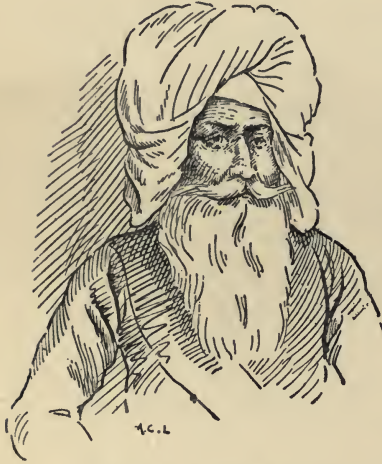
H.H. Raja Sir Hira Singh Bahadur of Nahba, Hon. Colonel 14th Sikhs.

champion of the Hindu inhabitants against the Musalman. The faith spread to most of the Hindu tribes of the Punjab, more especially to the vast cultivating race, the Jāts, which to this day is spread over the whole of Upper India.