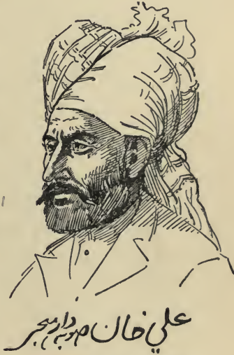
Subadar-Major, 20th Brownlow's Punjabis. Kambar Khel (Afridi).

The Afridi has less Jewish features than many of the Pathans, and some of them, with close-cropped fair hair and blue eyes, have a distinctly European appearance. It is curious, too, that on the border, Pathans of beautiful regular features are to be seen, especially among the lads, so that it is not incredible that the traces of the Greek soldier may still be visible. Between the Afridi Tirah, in the valley north of the Samana Range, are the Orakzai clans, who also give us soldiers.