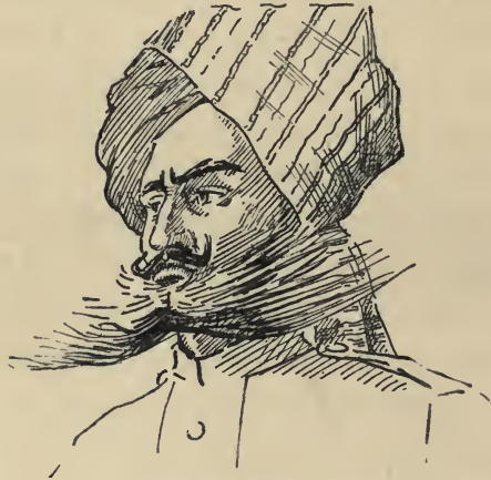
Sadul Light Infantry. Havildar.

Now and again since the Mutiny, if not before, discussion had taken place as to what was a fair contribution, if any, of native States towards the expense of the protection under which they flourished. It is not a century and a half since the