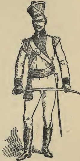
Native Officer, Calcutta Native Militia, 1795.

In 1811, a large naval and military force