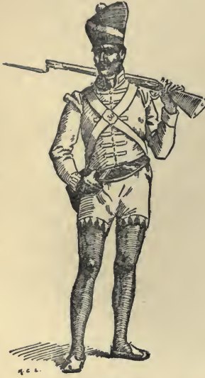
A Grenadier Sepoy of 80th Regiment of Bengal Native Infantry, 1815.

oversea purposes. In 1840, a large amount of British property had been destroyed by the Chinese in an attempt to solve by a short cut the opium problem, and an expedition under Sir Hugh Gough was sent to South China. The major portion of the force were troops of the Madras Line, for, as it had become a habit for the Bengal Army not to cross the seas, the usual volunteer battalions alone represented the Bengal Army.