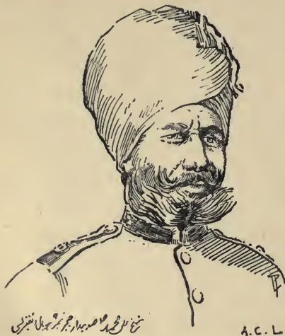
9th Bhopal Infantry. Subadar-Major. A Suni Musalman.

The Maharaja Scindia being himself an enthusiastic and well-read soldier, this force benefits by a considerable share of his personal attention. Outside these two States it will be simpler to refer to the States according to the circles already referred to. In the Punjab we have Patiala with one