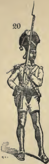
Naik, Bombay Grenadier Bat- talion, 1801.

march to Arracan had refused to go. These will be referred to in the chapter on the Great Mutiny. In 1824 the whole of the armies were reorganized and renumbered, the double-battalion regiments being abolished, and the line in each army was renumbered from 1 upwards by single battalions, receiving their new numbers in accordance with their original date of formation. The Army of 1824, therefore, was composed as follows :—