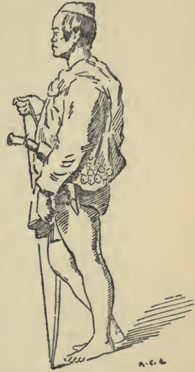
1st Gurkha Regiment, 1861.

The disturbance was then quelled, and the General at once promoted a naik who had come to the rescue of his adjutant. It is interesting to know that the General received a wiggling for doing so from the Military Department. Some show of promptness in the way of punishment did follow, however, for Mangal Pandey and the native officer in charge of the guard were shot before a month had elapsed. By this time the state of the army was the absorbing interest.