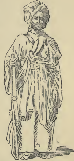
A Khyberl of the Queen's Own Corps of Guides, 1853.

fight, and show you on the ridge where So-and-so fell, but his eyes will glisten and his old heart warm, when he tells you of the Chandni Chowkh, the jewellers' street of Delhi. The old soldier who went to the Baillie Guard, the relief and capture of Lucknow, that is to say, will talk as much of the loot he brought away as of the fighting. According to him, the return of the Guides to the frontier was a sight to see, and was talked of in the Punjab for many a day after. Beautiful ladies transferred their affections to the men of the north, and rode in carts behind the baggage of the corps, and with them wealth that was the envy of every soldier of fortune in the country-side.