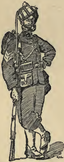
Havildar, Marine Battalion, 1885.

sea, has for many years been a peculiar asset of the British Empire. The power of transporting troops to distant scenes, and to protect them on the high seas, has belonged to Britain. Since ships do not sail over dry land, it is not the omnipotent navy alone that can clinch a war. The peculiar power that we have possessed in the past, to land our troops at that point where their very presence must produce an effect far out of proportion to