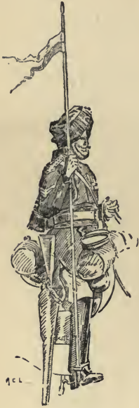
Daffadar. 13th Duke of Con- naught Lancers. Watson's Horse, 1885.

Baluchistan. The Bengal Army and Frontier Force formed the bulk of the Kabul Army; and the Bombay Army, the Kandahar Army, while several units from the Madras Army were moved up on to the lines of communication.