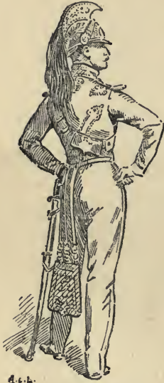
British Officer, Madras Horse Artillery, 1845.

“Levies” during the Mutiny. The 41st, it is interesting to note, were the 1st Infantry of the Gwalior Contingent, and the 42nd, 43rd, and 44th were the old Assam and Sylhet Light Infantry battalions. Three Line regiments that had survived the Mutiny, the 4th, 58th, and 73rd, were disbanded, as well as several local battalions.