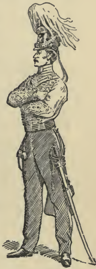
British Officer, 3rd Madras Light Cavalry, 1845.

Gradually the whole, however, of these two armies was organized on the same system as regards officers. The whole of the cavalry, except four regiments of Madras Light Cavalry, was organized on the silladar system which obtains to this day. Its whole principle is that Government pay so much per head, and the regiment finds everything except firearms. In the original days of silladar cavalry, it meant that the trooper received this amount and found himself in everything. In these days, when a regiment is expected to have itself equipped in a uniform way, it means that the men are required to enlist with a certain amount of money towards the purchase of their horse, and the regimental commander administers their pay so as to make it gradually cover