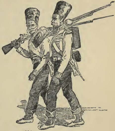
On the March.

European regiment a detachment of the 65th Foot was present, with some native artillery, and five Bombay native infantry regiments, with one auxiliary battalion. This latter eventually formed what is now the 123rd Outram's Rifles, while the other battalions that still survive are the 102nd Grenadiers, and the 112th and 113th Infantry. The glory in this battle of Kirkee lay in the audace, encore l'audace ; for the small force advanced against the huge hordes that had poured out of Poona over the Mutha river, and swarmed round it on the plain between Ganeshkind and Bamburda. As the force advanced, the Mahratta horse swept round it, to the confusion of some of the native corps, who, however, quickly rallied. The good Atkins of the day led the charge, a cannon-ball struck down the Mahratta banner, a grape-shot killed the leader of horse,