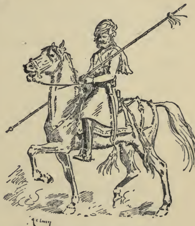
17th Regiment Bengal Irregular Cavalry, 1850.

The Grand Army had been assembling at Kanauj, where the large force of cavalry, three regiments of dragoons, and five regiments of native cavalry had been exercised together for some months and trained as a division. It was here that the first horse artillery was formed, by attaching two six-pounder galloper guns to each cavalry regiment. The infantry of the force consisted of one European battalion, the 76th, and eleven native battalions.