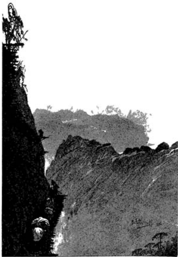
AN OVRING IN THE PAMIRS