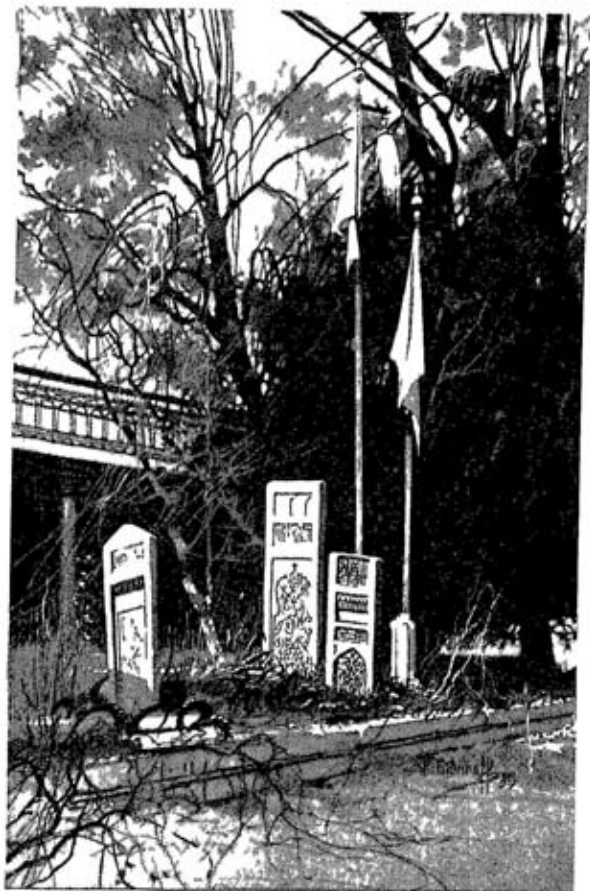
HODJA-AKHRAR, THE SAINT'S TOMB