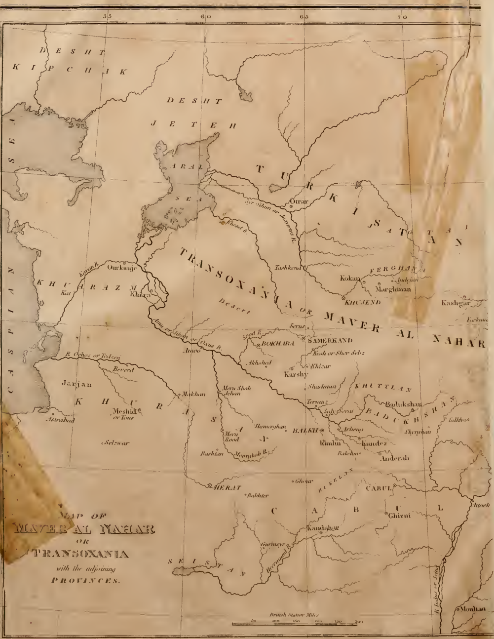
MAP OF MAVER AL NAHAR OR TRANSOXANIA with the adjoining PROVINCES.