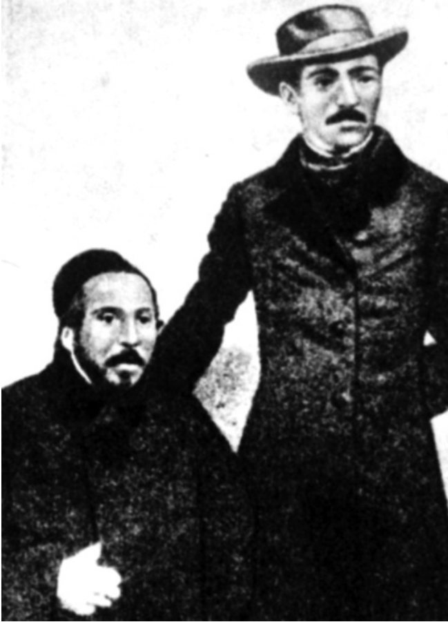
FIGURE 8.2 Ion Ghica and Vasile Alecsandri in Istanbul, 1855.

In the first phase of his career, Ghica produced a number of informative works, including brochures on economic matters such as the customs union between Moldavia and Wallachia, the adoption of modern weights and measures, political projects and survey reports on the situation of the Principalities. 18 But he also experimented with literary genres, including theatre and fiction. 19