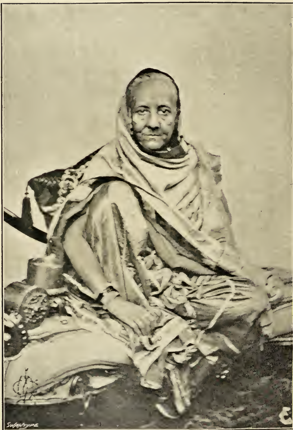
THE BEGUM ZURAT MAHAL, Chief Wife of the King of Delhi.

Taken when she was a prisoner after the Mutiny, 1857.