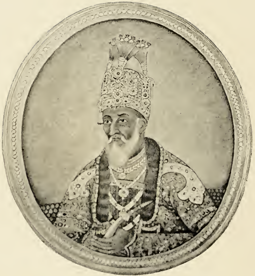
THE EMPEROR BAHADUR SHAH, King of Delhi in 1857

After a miniature painted for the late Sir Theophilus Metcalfe, 1844.