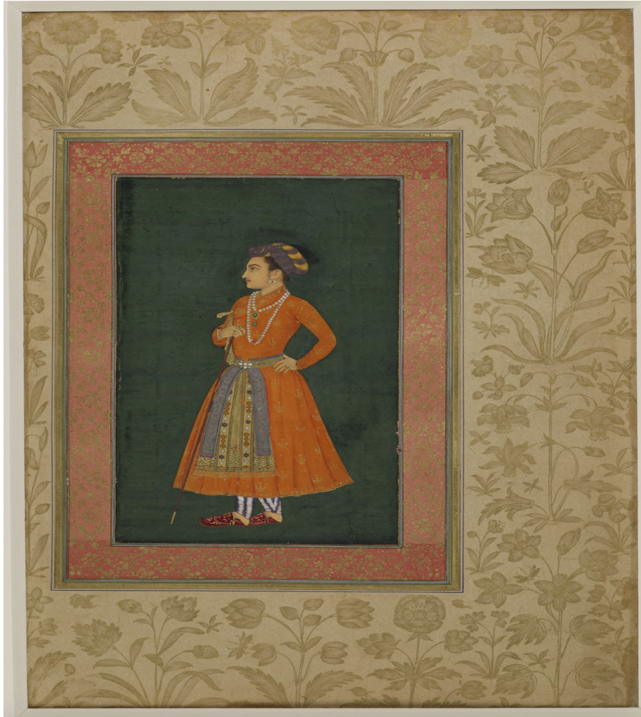
Portrait of the Prince Dara Shikoh (1631-32)