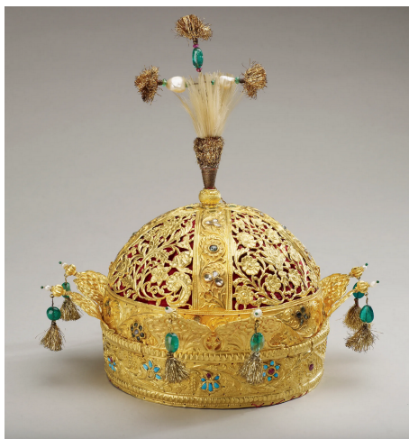
Crown of the Emperor Bahadur Shah II, (mid 19th c), on loan from the Royal Collection Trust.