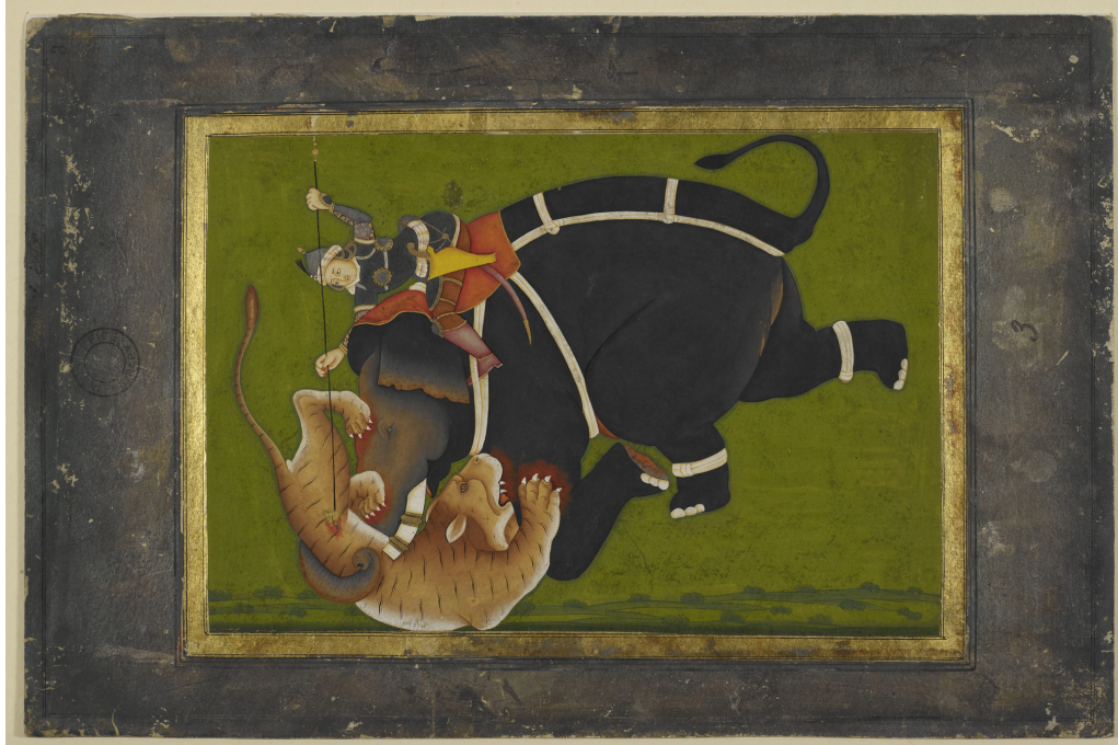
Elephant trampling a tiger.