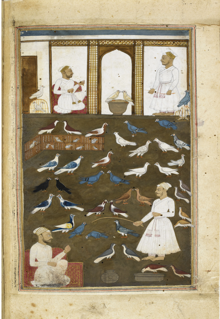
Instructional poem for pigeon -fanciers by Valih Musavi.