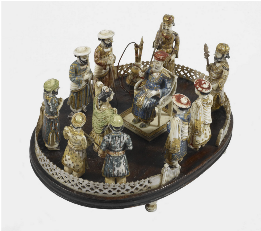
Akbar Shah II listening to singers and musicians.