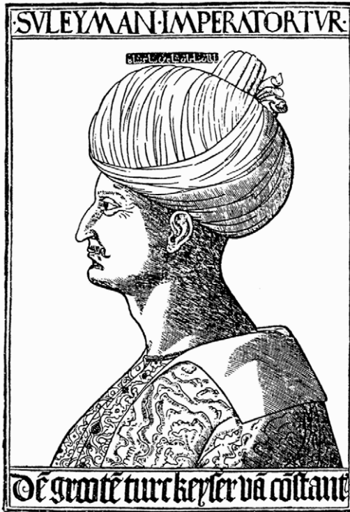
Suleyman the Magnificent (r. 1520-1566)