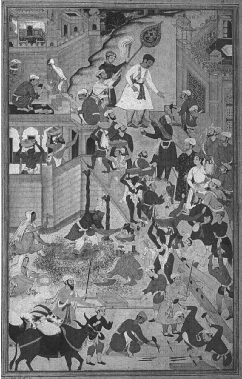
Figure 1. Painting by Tulsi, with Akbar's figure by Madho the Younger (c.1595). Abu'l-Fazl, Akbarnama (Calcutta, 1984). Reproduced from Moosvi, People, Taxation, and Trade in Mughal India . Used with permission.