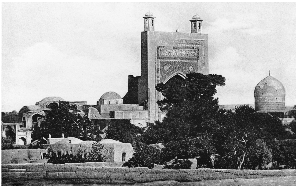
FIGURE 8. Timurid mosque and shrine, Torbat-i Jam, 1913. (From Ernst Diez, Churasanische Baudenkmäler [Berlin: D. Reimer, 1918])

Sufi spiritual leaders, and regular followers to one another, in the process shaping the sociopolitical dynamics of the Timurid-ruled medieval society.